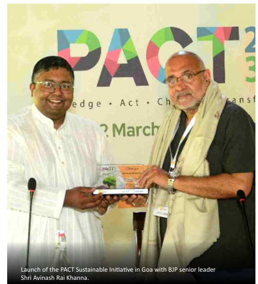
Launch of the PACT Sustainable Initiative in Goa with BJP senior leader Shri Avinash Rai Khanna.

PACT2030 brings together like-minded leaders, founders/heads, and chancellors of academic institutions, policy makers and the government to engage all the intelligent forces for creating a better world. PACT2030 was established as a formal initiative in November 2021 and champions change, not just by bringing leaders together; but by ensuring that they commit to the long-term vision of change for a better world.