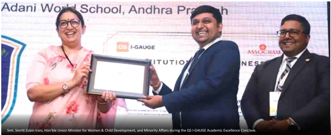
Smt. Smriti Zubin Irani, Hon'ble Union Minister for Women & Child Development, and Minority Affairs during the QS I-GAUGE Academic Excellence Conclave.